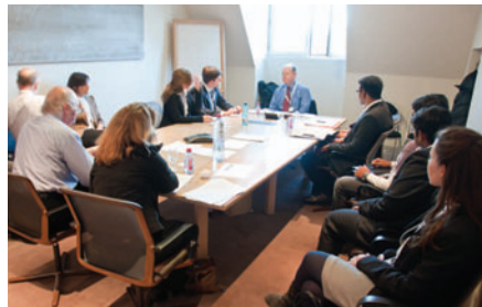
Students and professionals join forces during the ICC International Commercial Mediation Competition.

Students also participate in our renowned ICC International Commercial Mediation Competition. This annual six-day tournament sees competitors applying the ICC ADR Rules to solve international commercial disputes. Student teams from law and business schools around the world meet to test their advocating, negotiation and problem-solving skills in mock sessions led by some of the world's leading commercial mediators. Read more at www.iccadr.org .