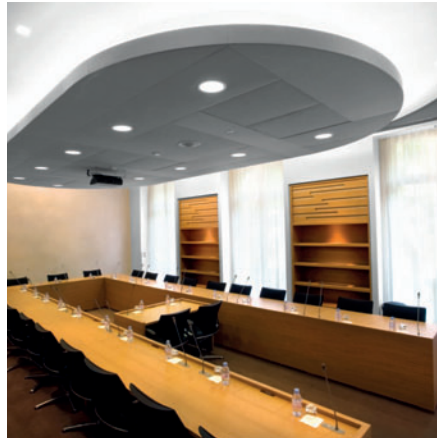
The ICC Hearing Centre offers fully-equipped rooms for meetings of all sizes.